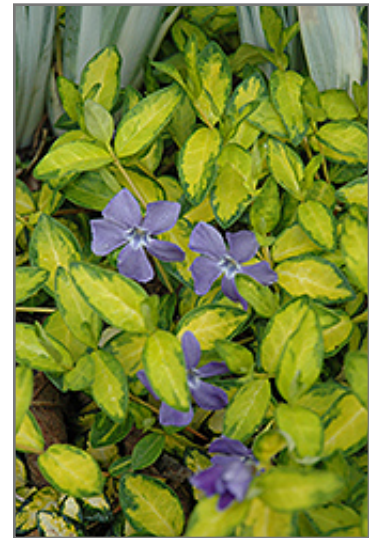
Illumination Periwinkle flowers

Illumination Periwinkle is a fine choice for the garden, but it is also a good selection for planting in outdoor pots and containers. Because of its spreading habit of growth, it is ideally suited for use as a 'spiller' in the 'spiller-thriller-filler' container combination; plant it near the edges where it can spill gracefully over the pot. Note that when growing plants in outdoor containers and baskets, they may require more frequent waterings than they would in the yard or garden.