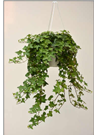
English Ivy