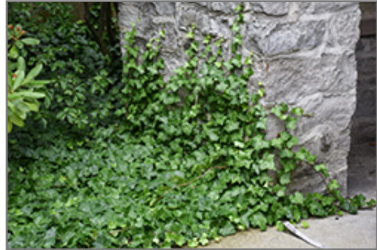
English Ivy

English Ivy makes a fine choice for the outdoor landscape, but it is also well-suited for use in outdoor pots and containers. Because of its spreading habit of growth, it is ideally suited for use as a 'spiller' in the 'spiller-thriller-filler' container combination; plant it near the edges where it can spill gracefully over the pot. Note that when grown in a container, it may not perform exactly as indicated on the tag - this is to be expected. Also note that when growing plants in outdoor containers and baskets, they may require more frequent waterings than they would in the yard or garden.