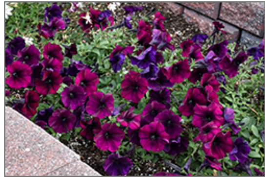
Easy Wave Burgundy Velour Petunia flowers