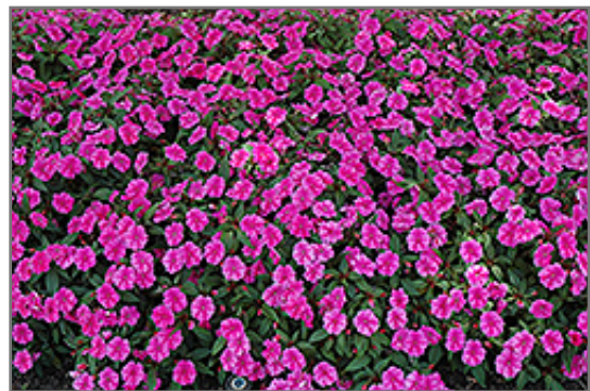
Bounce Pink Flame Impatiens in bloom