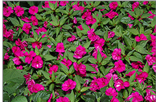
Big Bounce Violet Impatiens in bloom