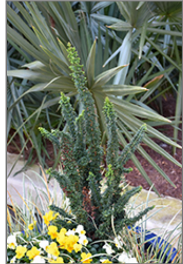
Chirimen Hinoki Falsecypress

Chirimen Hinoki Falsecypress makes a fine choice for the outdoor landscape, but it is also well-suited for use in outdoor pots and containers. With its upright habit of growth, it is best suited for use as a 'thriller' in the 'spiller-thriller-filler' container combination; plant it near the center of the pot, surrounded by smaller plants and those that spill over the edges. Note that when grown in a container, it may not perform exactly as indicated on the tag - this is to be expected. Also note that when growing plants in outdoor containers and baskets, they may require more frequent waterings than they would in the yard or garden.