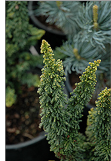
Chirimen Hinoki Falsecypress foliage