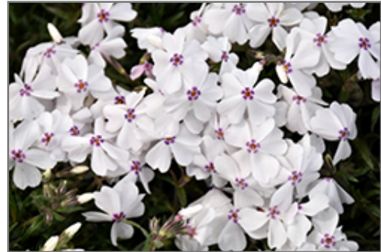
Amazing Grace Moss Phlox flowers