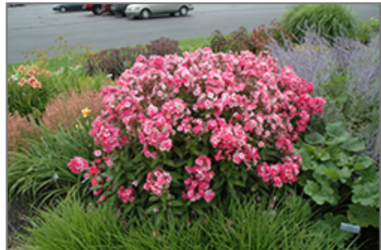
Garden Girls Glamour Girl Garden Phlox in bloom

Garden Girls Glamour Girl Garden Phlox will grow to be about 28 inches tall at maturity, with a spread of 24 inches. When grown in masses or used as a bedding plant, individual plants should be spaced approximately 18 inches apart. It grows at a medium rate, and under ideal conditions can be expected to live for approximately 10 years. As an herbaceous perennial, this plant will usually die back to the crown each winter, and will regrow from the base each spring. Be careful not to disturb the crown in late winter when it may not be readily seen!