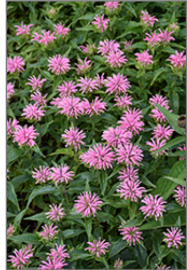
Pardon My Pink Beebalm flowers

Pardon My Pink Beebalm is recommended for the following landscape applications;