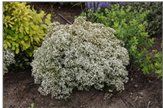
Summer Sparkles Baby's Breath in bloom