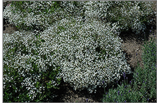
Summer Sparkles Baby's Breath in bloom

This plant should only be grown in full sunlight. It prefers dry to average moisture levels with very well-drained soil, and will often die in standing water. It is considered to be drought-tolerant, and thus makes an ideal choice for a low-water garden or xeriscape application. It is not particular as to soil type, but has a definite preference for alkaline soils, and is able to handle environmental salt. It is highly tolerant of urban pollution and will even thrive in inner city environments. This is a selected variety of a species not originally from North America.