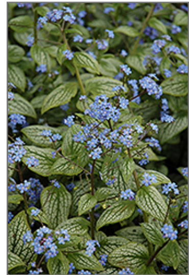
Silver Heart Bugloss flowers