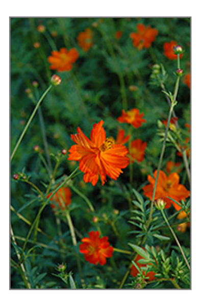
Tall Orange Cosmos flowers

A vigorous variety, sure to thrive in any garden; free flowering with a well branched, upright habit; vibrant orange flowers over the lacy foliage, gives an airy touch to the garden or border; best in full sun; tolerates poor soil, heat and humidity