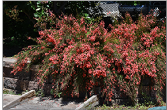
Firecracker Plant in bloom