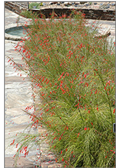
Firecracker Plant in bloom

Firecracker Plant is a fine choice for the garden, but it is also a good selection for planting in outdoor containers and hanging baskets. Because of its height, it is often used as a 'thriller' in the 'spiller-thriller-filler' container combination; plant it near the center of the pot, surrounded by smaller plants and those that spill over the edges. It is even sizeable enough that it can be grown alone in a suitable container. Note that when growing plants in outdoor containers and baskets, they may require more frequent waterings than they would in the yard or garden.