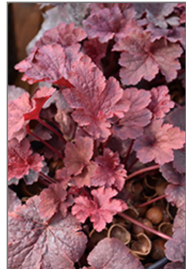
Cajun Fire Coral Bells foliage

Cajun Fire Coral Bells is recommended for the following landscape applications;