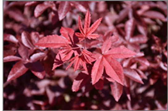
Rhode Island Red Japanese Maple foliage

Rhode Island Red Japanese Maple will grow to be about 12 feet tall at maturity, with a spread of 12 feet. It has a low canopy with a typical clearance of 3 feet from the ground, and is suitable for planting under power lines. It grows at a slow rate, and under ideal conditions can be expected to live for 80 years or more.