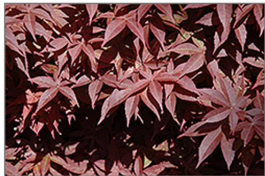
Rhode Island Red Japanese Maple foliage