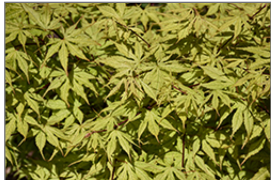
Grandma Ghost Japanese Maple foliage

Grandma Ghost Japanese Maple is recommended for the following landscape applications;