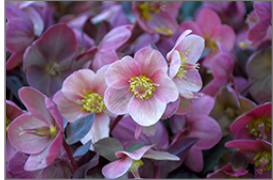
Pink Frost Hellebore flowers

This plant does best in partial shade to shade. It does best in average to evenly moist conditions, but will not tolerate standing water. It is not particular as to soil pH, but grows best in rich soils. It is somewhat tolerant of urban pollution, and will benefit from being planted in a relatively sheltered location. This particular variety is an interspecific hybrid, and parts of it are known to be toxic to humans and animals, so care should be exercised in planting it around children and pets. It can be propagated by division; however, as a cultivated variety, be aware that it may be subject to certain restrictions or prohibitions on propagation.