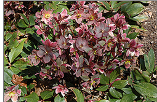
Pink Frost Hellebore in bloom