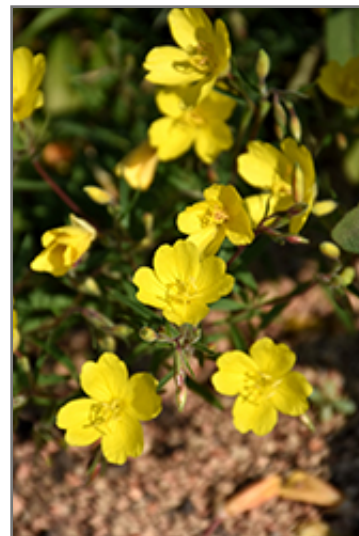
Lemon Drop Primrose flowers

Lemon Drop Primrose is recommended for the following landscape applications;