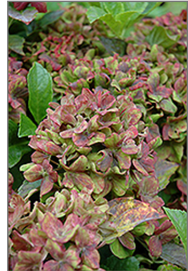
Pistachio Hydrangea flowers