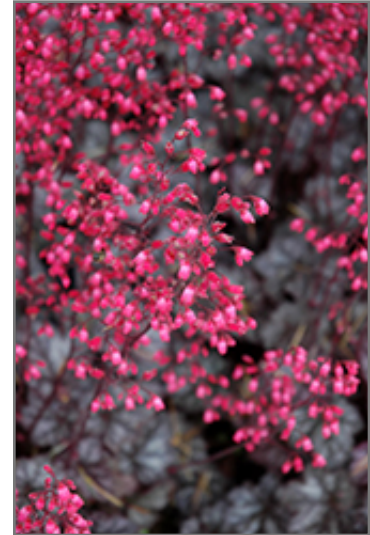
Glitter Coral Bells flowers

Glitter Coral Bells will grow to be about 10 inches tall at maturity extending to 16 inches tall with the flowers, with a spread of 14 inches. When grown in masses or used as a bedding plant, individual plants should be spaced approximately 12 inches apart. Its foliage tends to remain low and dense right to the ground. It grows at a medium rate, and under ideal conditions can be expected to live for approximately 10 years. As an evergreen perennial, this plant will typically keep its form and foliage year-round.