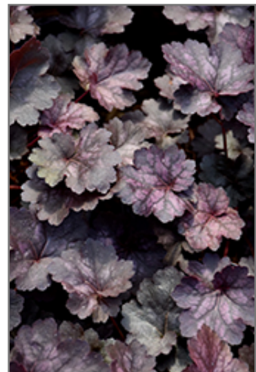
Glitter Coral Bells foliage