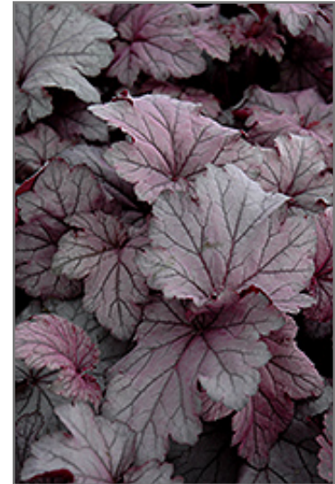
Spellbound Coral Bells foliage