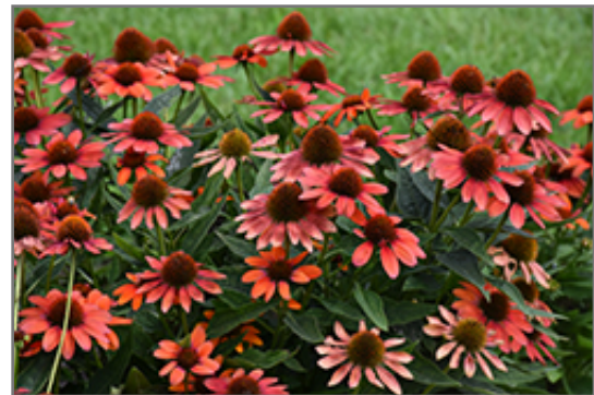
Sombrero Flamenco Orange Coneflower flowers