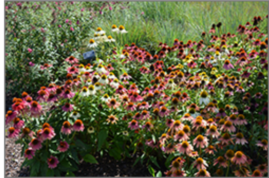
Cheyenne Spirit Coneflower in bloom

Cheyenne Spirit Coneflower will grow to be about 16 inches tall at maturity extending to 24 inches tall with the flowers, with a spread of 18 inches. Its foliage tends to remain dense right to the ground, not requiring facer plants in front. It grows at a medium rate, and under ideal conditions can be expected to live for approximately 10 years. As an herbaceous perennial, this plant will usually die back to the crown each winter, and will regrow from the base each spring. Be careful not to disturb the crown in late winter when it may not be readily seen!