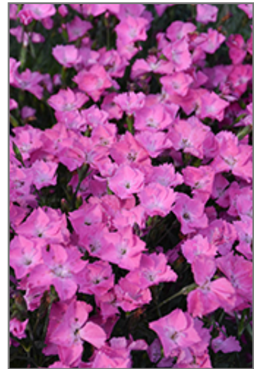
Beauties Kahori Pink Pinks flowers

Beauties Kahori Pink Pinks is recommended for the following landscape applications;