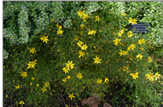
Electric Avenue Tickseed in bloom