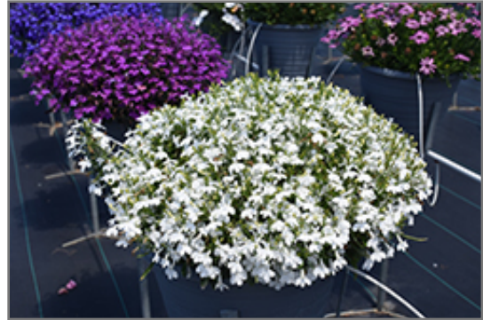
Techno Upright White Lobelia in bloom

Techno Upright White Lobelia will grow to be about 10 inches tall at maturity, with a spread of 12 inches. When grown in masses or used as a bedding plant, individual plants should be spaced approximately 10 inches apart. Its foliage tends to remain low and dense right to the ground. Although it's not a true annual, this fast-growing plant can be expected to behave as an annual in our climate if left outdoors over the winter, usually needing replacement the following year. As such, gardeners should take into consideration that it will perform differently than it would in its native habitat.