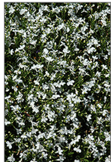
Techno Upright White Lobelia flowers