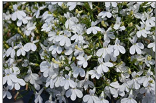
Techno Upright White Lobelia flowers

Techno Upright White Lobelia is recommended for the following landscape applications;