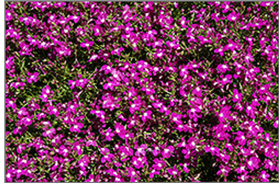
Magadi Electric Purple Lobelia flowers

Magadi Electric Purple Lobelia will grow to be about 10 inches tall at maturity, with a spread of 10 inches. When grown in masses or used as a bedding plant, individual plants should be spaced approximately 8 inches apart. Its foliage tends to remain low and dense right to the ground. Although it's not a true annual, this fast-growing plant can be expected to behave as an annual in our climate if left outdoors over the winter, usually needing replacement the following year. As such, gardeners should take into consideration that it will perform differently than it would in its native habitat.