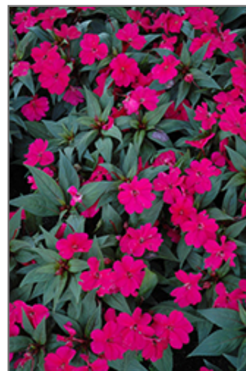
SunPatens Compact Royal Magenta New Guinea Impatiens flowers