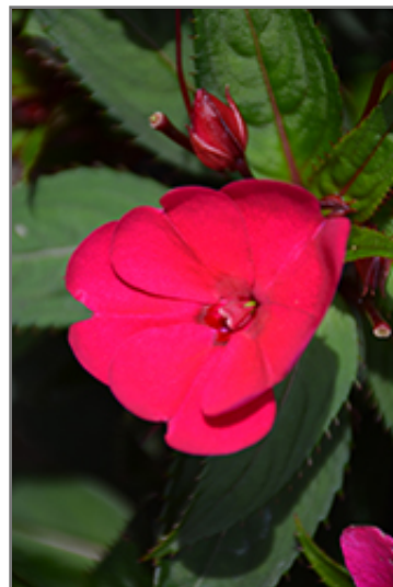
SunPatens Compact Royal Magenta New Guinea Impatiens flowers

This plant will require occasional maintenance and upkeep, and should not require much pruning, except when necessary, such as to remove dieback. It is a good choice for attracting bees and butterflies to your yard. It has no significant negative characteristics.