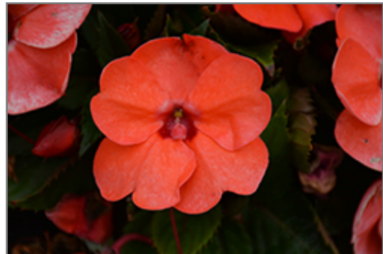
SunPatiens Compact Hot Coral New Guinea Impatiens flowers

This plant will require occasional maintenance and upkeep, and should not require much pruning, except when necessary, such as to remove dieback. It is a good choice for attracting bees and butterflies to your yard. It has no significant negative characteristics.