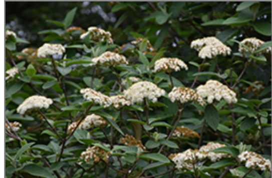
Alleghany Viburnum flowers

Alleghany Viburnum is recommended for the following landscape applications;