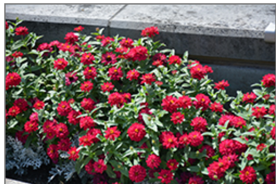
Profusion Double Hot Cherry Zinnia in bloom