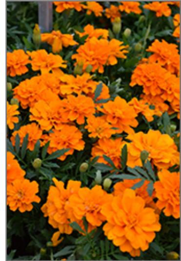
Durango Tangerine Marigold flowers

Durango Tangerine Marigold is a fine choice for the garden, but it is also a good selection for planting in outdoor pots and containers. It is often used as a 'filler' in the 'spiller-thriller-filler' container combination, providing a mass of flowers against which the larger thriller plants stand out. Note that when growing plants in outdoor containers and baskets, they may require more frequent waterings than they would in the yard or garden.