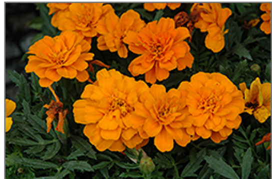
Durango Tangerine Marigold flowers