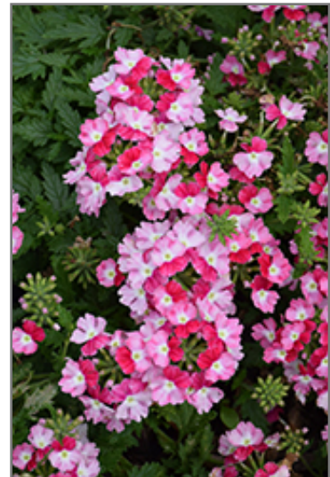
Lanai Twister Red Verbena flowers

Lanai Twister Red Verbena is recommended for the following landscape applications;