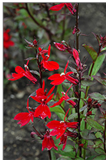
Fan Scarlet Cardinal Flower flowers