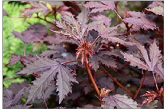
Mahogany Splendor Hibiscus foliage