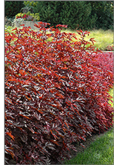
Mahogany Splendor Hibiscus

Mahogany Splendor Hibiscus is recommended for the following landscape applications;