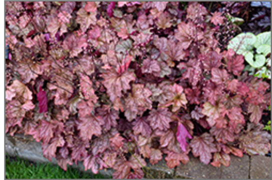
Carnival Watermelon Coral Bells in bloom

Carnival Watermelon Coral Bells will grow to be about 12 inches tall at maturity extending to 18 inches tall with the flowers, with a spread of 14 inches. When grown in masses or used as a bedding plant, individual plants should be spaced approximately 10 inches apart. Its foliage tends to remain dense right to the ground, not requiring facer plants in front. It grows at a medium rate, and under ideal conditions can be expected to live for approximately 10 years. As an evergreen perennial, this plant will typically keep its form and foliage year-round.