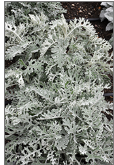
Silver Dust Dusty Miller foliage

Silver Dust Dusty Miller is a fine choice for the garden, but it is also a good selection for planting in outdoor containers and hanging baskets. It is often used as a 'filler' in the 'spiller-thriller-filler' container combination, providing a mass of flowers and foliage against which the larger thriller plants stand out. Note that when growing plants in outdoor containers and baskets, they may require more frequent waterings than they would in the yard or garden.