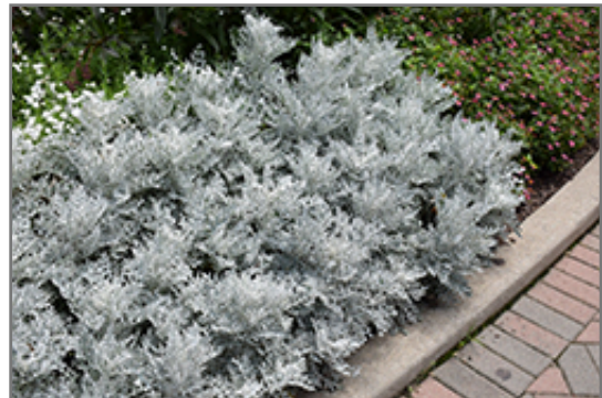
Silver Dust Dusty Miller

Silver Dust Dusty Miller is recommended for the following landscape applications;