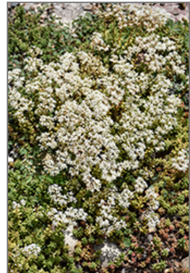
Baby Tears Stonecrop in bloom

Baby Tears Stonecrop is recommended for the following landscape applications;