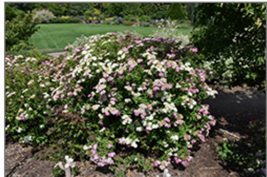
Shirobana Spirea in bloom