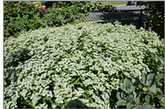
Short Toothed Mountain Mint in bloom