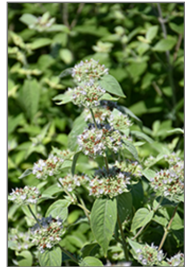
Short Toothed Mountain Mint flowers

This is a relatively low maintenance plant, and should be cut back in late fall in preparation for winter. It is a good choice for attracting bees and butterflies to your yard, but is not particularly attractive to deer who tend to leave it alone in favor of tastier treats. It has no significant negative characteristics.