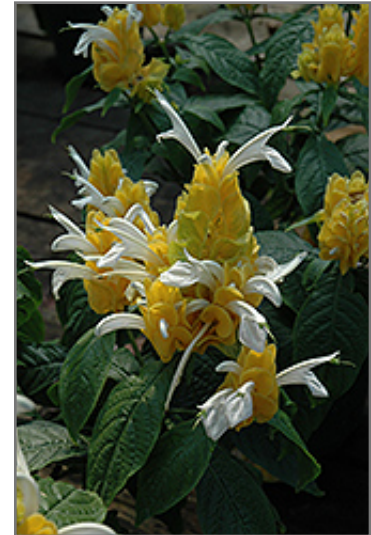
Golden Shrimp Plant flowers