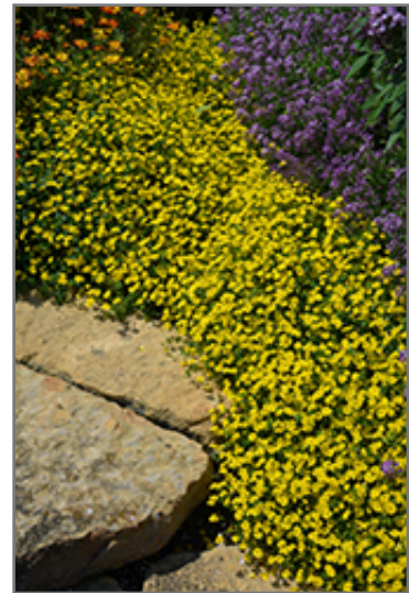
Gold Dust Mecardonia in bloom