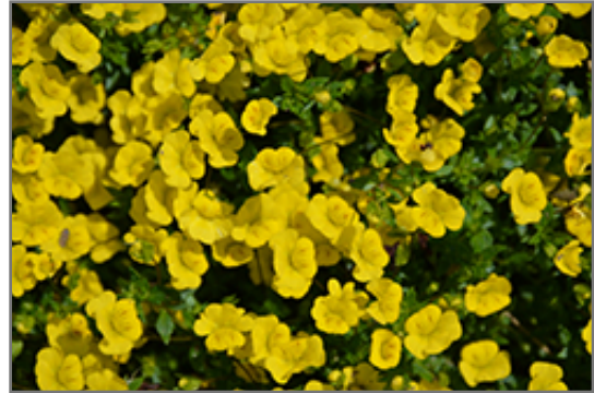
Gold Dust Mecardonia flowers

Gold Dust Mecardonia is a fine choice for the garden, but it is also a good selection for planting in outdoor pots and containers. Because of its spreading habit of growth, it is ideally suited for use as a 'spiller' in the 'spiller-thriller-filler' container combination; plant it near the edges where it can spill gracefully over the pot. Note that when growing plants in outdoor containers and baskets, they may require more frequent waterings than they would in the yard or garden.