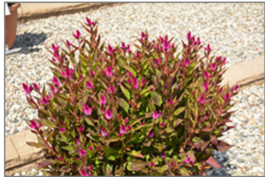
Intenz Classic Celosia in bloom

Intenz Classic Celosia will grow to be about 14 inches tall at maturity, with a spread of 12 inches. When grown in masses or used as a bedding plant, individual plants should be spaced approximately 10 inches apart. Its foliage tends to remain dense right to the ground, not requiring facer plants in front. This fast-growing annual will normally live for one full growing season, needing replacement the following year.