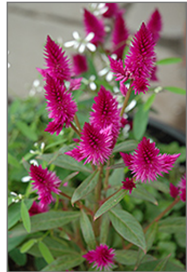
Intenz Classic Celosia flowers

Intenz Classic Celosia is recommended for the following landscape applications;