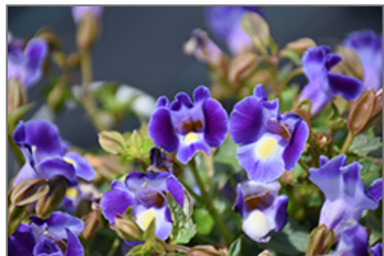
Catalina Midnight Blue Torenia flowers