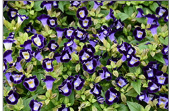
Catalina Midnight Blue Torenia flowers

This plant will require occasional maintenance and upkeep, and should not require much pruning, except when necessary, such as to remove dieback. It is a good choice for attracting bees and hummingbirds to your yard, but is not particularly attractive to deer who tend to leave it alone in favor of tastier treats. It has no significant negative characteristics.