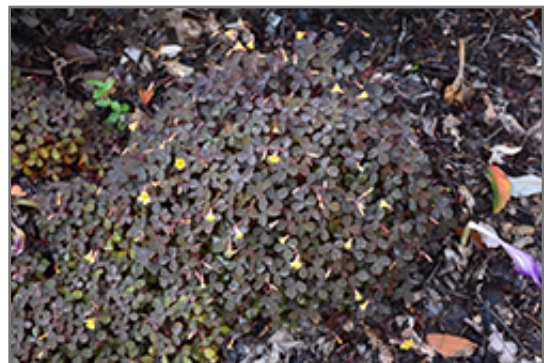
Zinfandel Shamrock