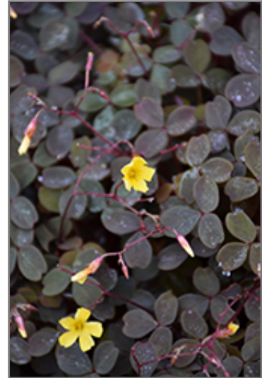
Zinfandel Shamrock flowers

Zinfandel Shamrock is a fine choice for the garden, but it is also a good selection for planting in outdoor containers and hanging baskets. It is often used as a 'filler' in the 'spiller-thriller-filler' container combination, providing a mass of flowers and foliage against which the thriller plants stand out. Note that when growing plants in outdoor containers and baskets, they may require more frequent waterings than they would in the yard or garden.