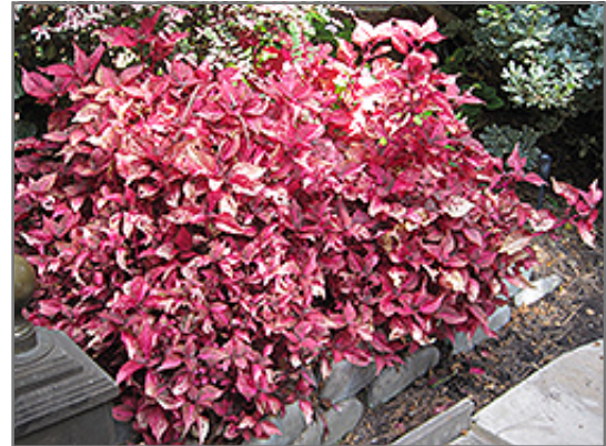
Blood Leaf