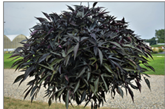
Illusion Midnight Lace Sweet Potato Vine