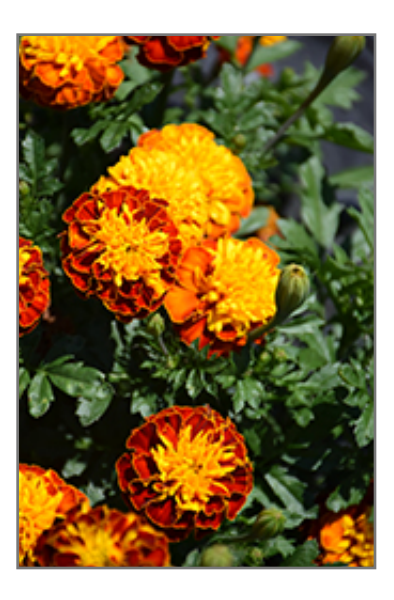
Janie Spry Marigold flowers

Janie Spry Marigold features bold semi-double brick red pincushion flowers with yellow centers at the ends of the stems from late spring to late summer. The flowers are excellent for cutting. Its fragrant ferny leaves remain dark green in color throughout the season.