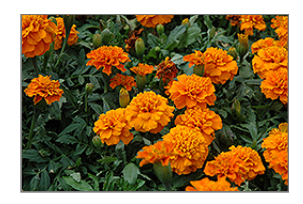
Janie Deep Orange Marigold flowers