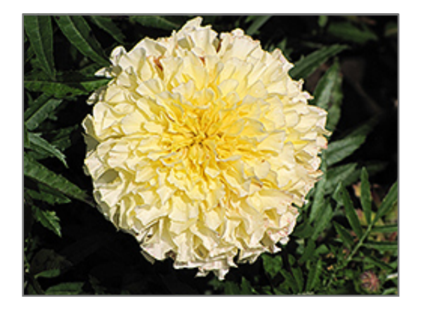
Vanilla Marigold flowers